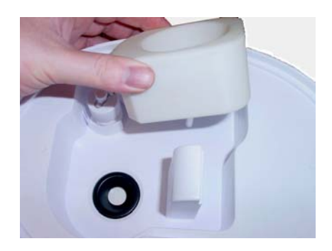
Fig. 10 A

Filters are not included with the humidifier and can be purchased separately.